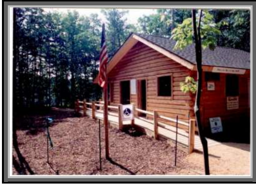
Mirror Lake State Park Accessible Cabin - 1991